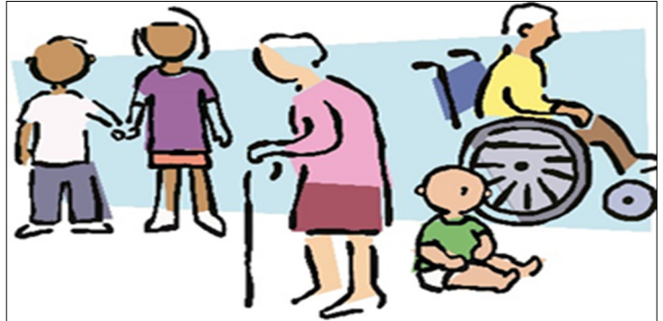
Sanctity of Life Sunday, January 21.

If you would consider to begin receiving it by email, simply send us an email request, let us know your snail mail address and we will add you to our newsletter email list.